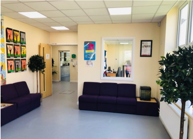
Reception to St. John's College